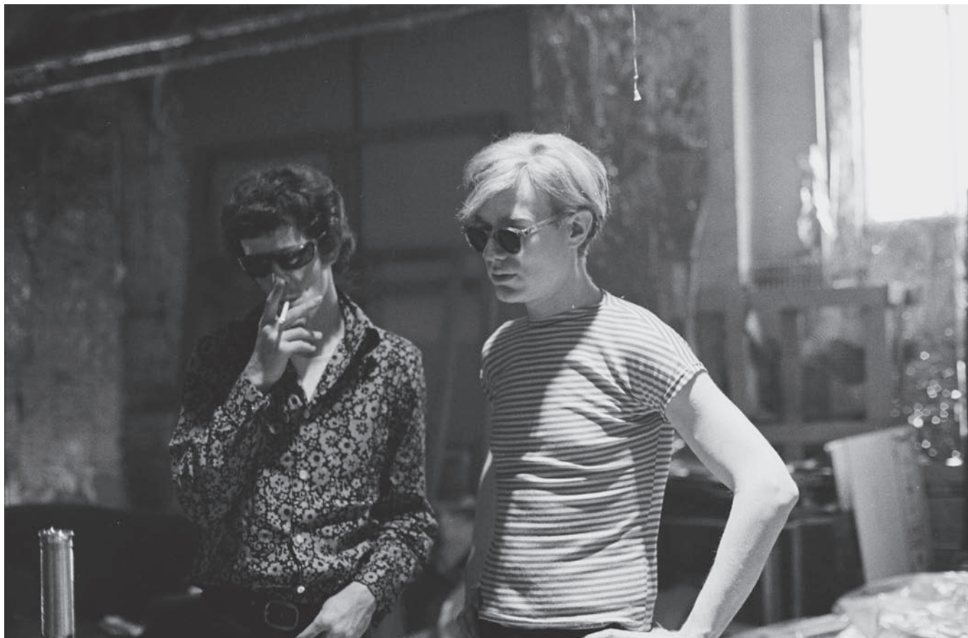
Photography: Gretchen Berg, 1966 NYC