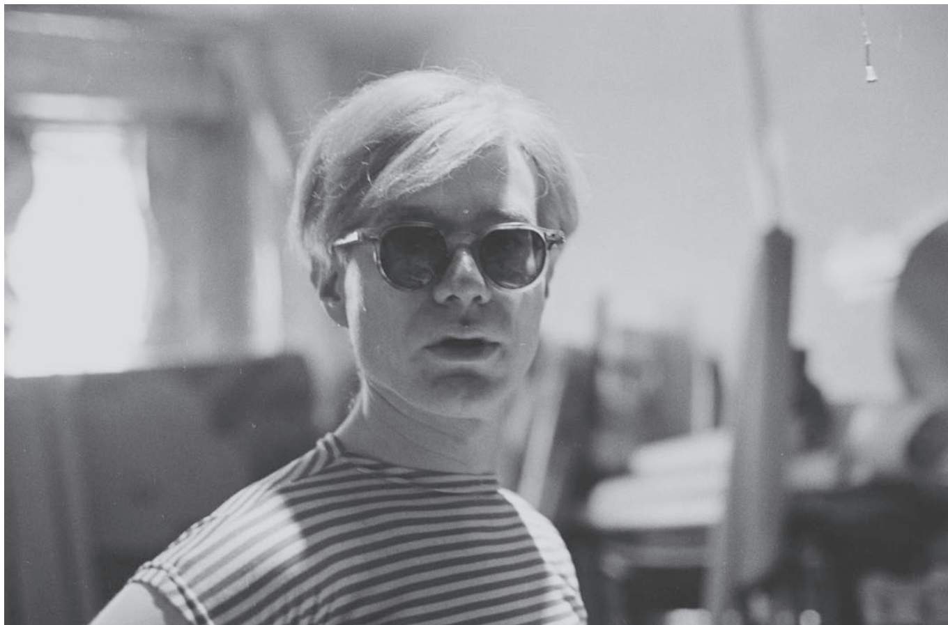
Photography: Gretchen Berg, 1966 NYC